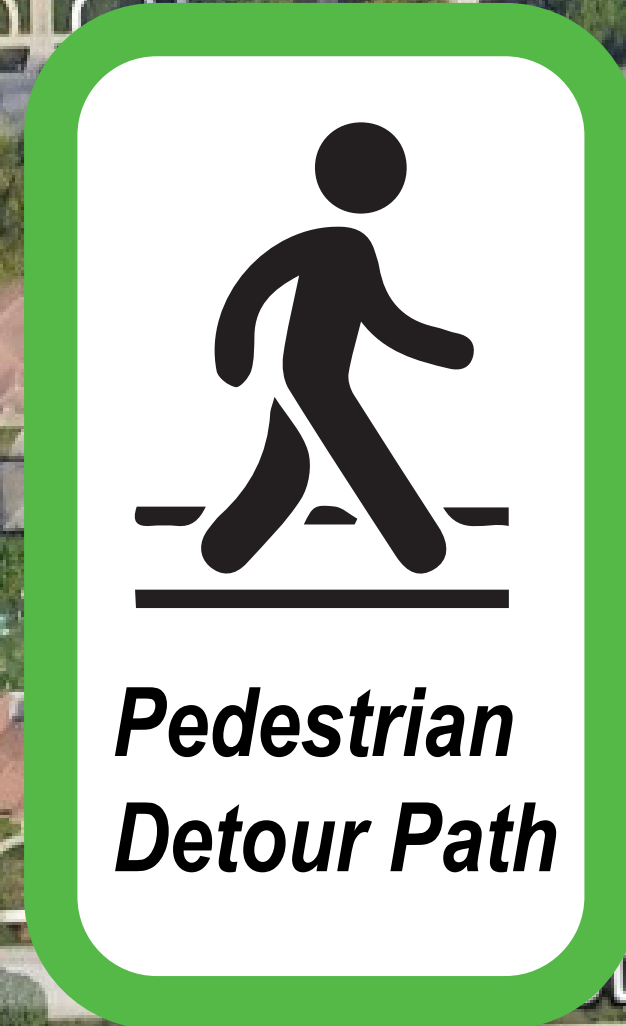
Pedestrian Detour Path